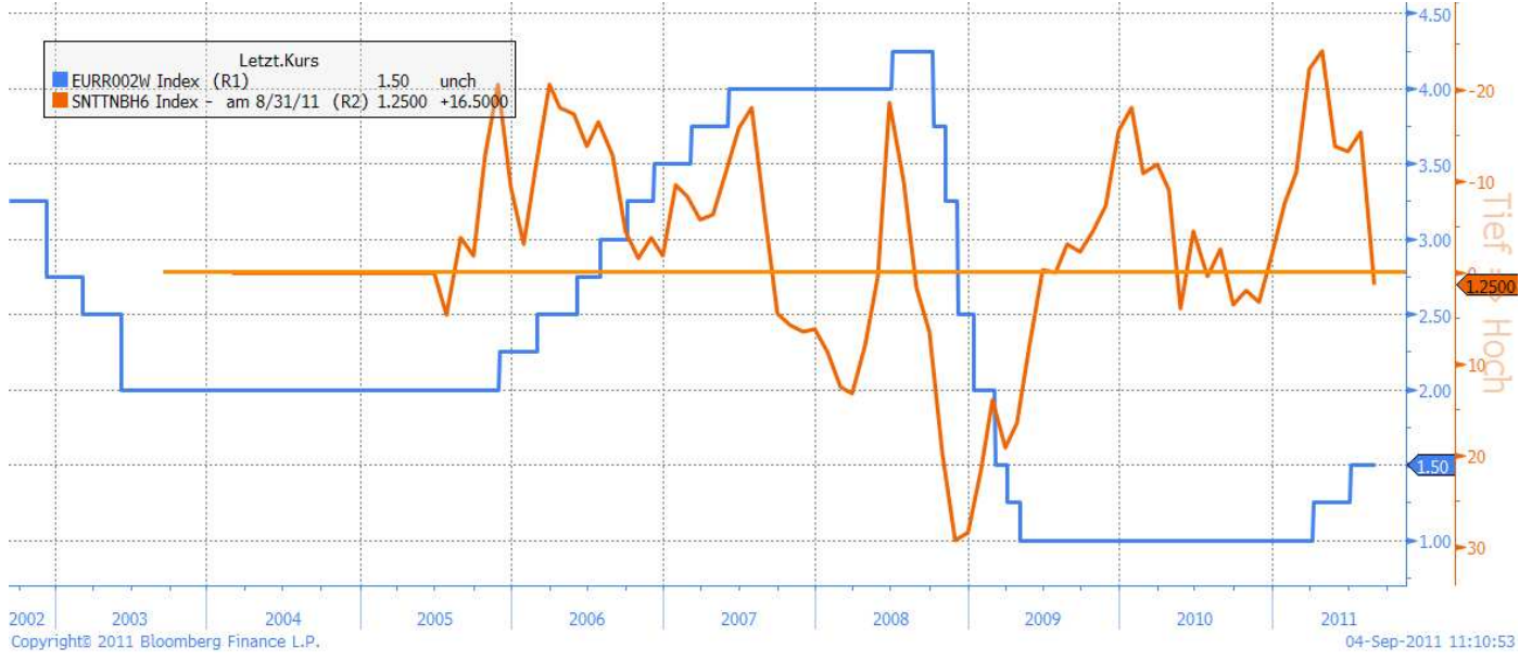
EZB main refinancing rate and sentix topics index Central bank policy (Headline Index)

This thought can be clearly found in the topic indices. The following chart shows the main refinancing rate of the ECB in comparison to the sentix topic index central bank politics. On the one hand, investors are more fickle than central bankers – but these basically always react 'behind the curve', after investors have assumed a sustained change in the surrounding context.