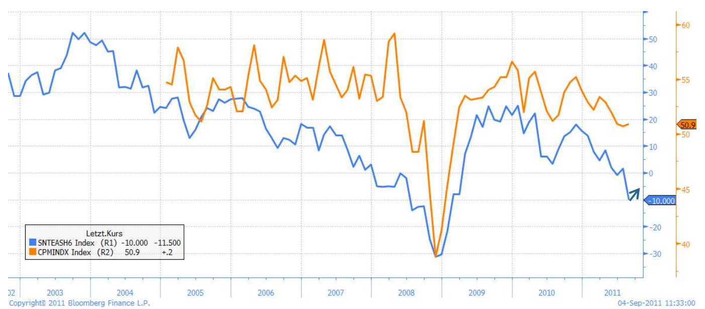
China leading indication: sentix Economic index Asia ex Japan (expectations) and China PMI-Index