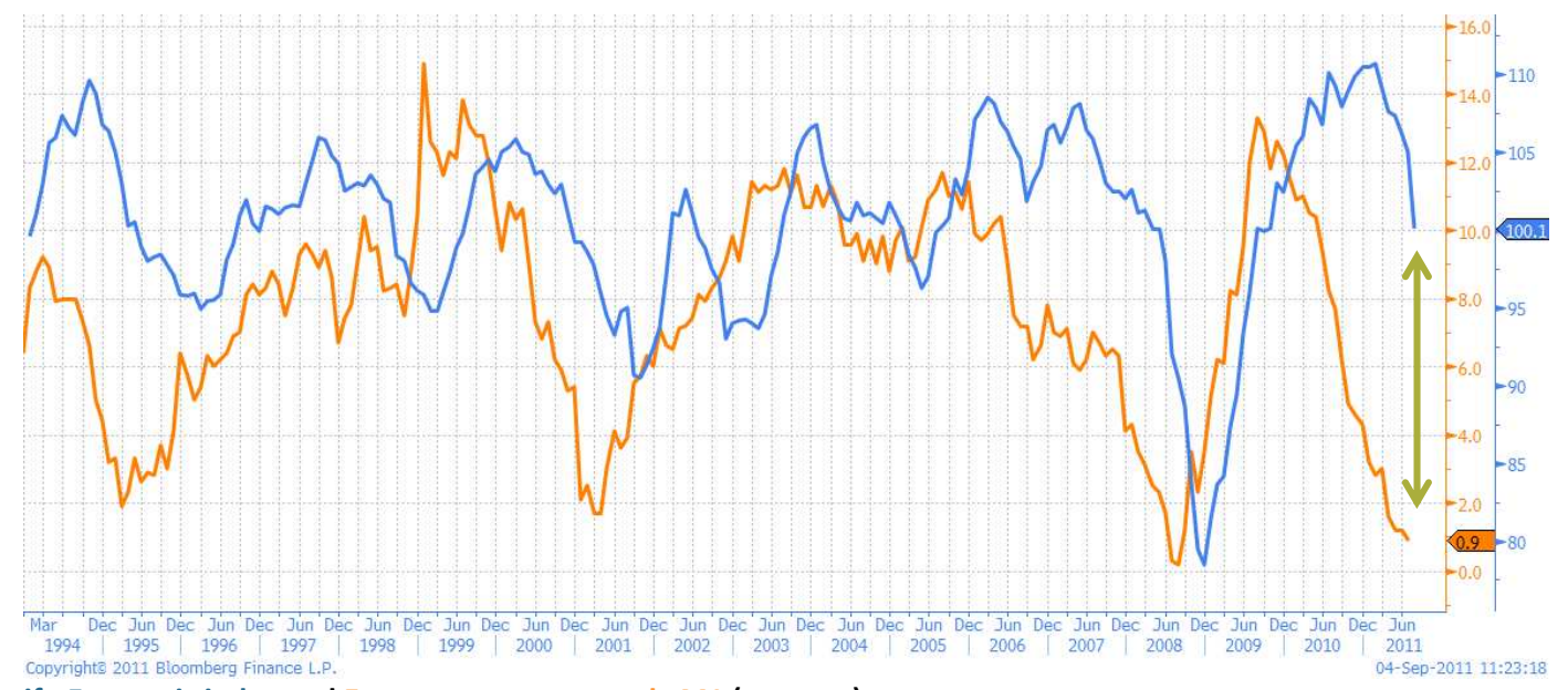
ifo Economic index and Euro area-money supply M1 (yoy rate)