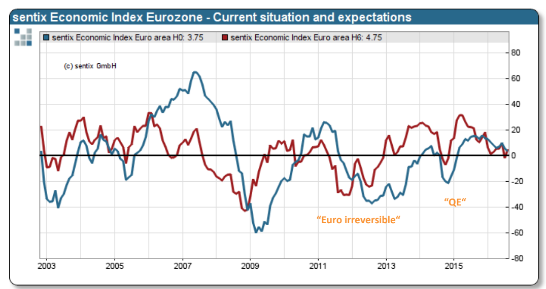
sentix Economic Index for the Eurozone: current situation and expectations

The Brexit shock has negatively impacted expectations only temporary. Worries about an economic downturn have not intensified in August. The headline index for the Eurozone has indeed again slipped back to +3.8 points (the lowest value since February 2015). Nevertheless, economic expectations have improved significantly by +6.8 to +4.8 points. The devaluation of the British pound and monetary easing by the Bank of England should have boosted investors' expectations. According to investors surveyed by sentix, the British economy is not expected to plunge into recession.