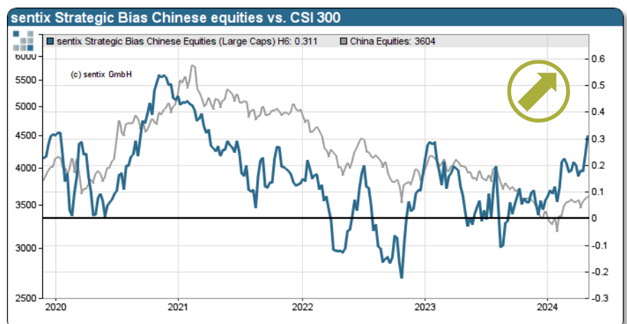
sentix Strategic Bias Chinese equities and CSI 300

One of our recommendations from the 2024 annual outlook is scoring points with more and more investors: at +31 percentage points, the strategic bias for the CSI 300 has reached its highest level since April 2021. Fortunately, at +14 percentage points, sentiment does not indicate that the market is overheating. The other equity markets are also gaining further confidence among investors. While the bias is increasing in many equity markets, it is crumbling in bonds. The consolidation in precious metals and bitcoins is also constructive.